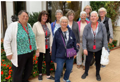
Encore Casino Trip