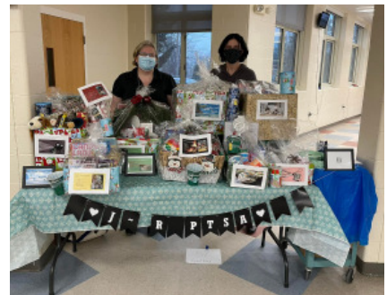
Holiday Craft Fair

In 2021 we were able to get back together for Senior Coffee, Create & Connect, Zumba, Zumba Gold, and going on trips again. This year we visited The Marina Brattleboro, VT, Old Mill Westminster, MA, Ogunquit, Maine Day Trip, Encore Casino Everett, MA, Hobo Railroad Lincoln, NH, Joey's Diner Amherst, NH, and Gift of Lights Loudon, NH. Our Covid-19 guidelines had changed throughout the year and we are sure it will continue into 2022. Covid-19 has been a social disaster for everyone but especially our Seniors. We are so happy to see them back having fun and enjoying each other's company and creating new memories.