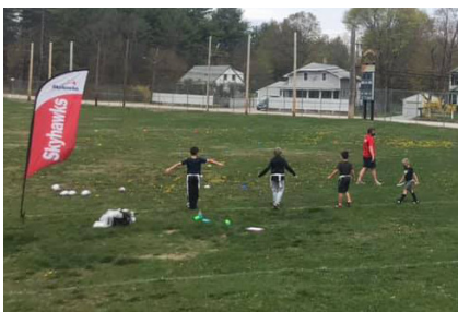
Skyhawks Flag Football