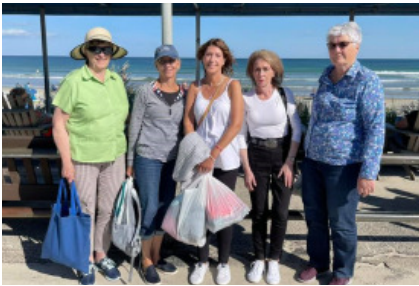
Ogunquit Beach Trip

In 2021 we were still dealing with Covid-19. Programs and events had to be modified, however; many people were excited to be back in some capacity. We were able to bring back Moonlight Hike, Afterschool 3v3 Soccer, Winter Explorer's Overnight, Skyhawks Flag Football Camp, Skyhawks Softball Camp, Camp Rec, Youth Soccer, Karate, Toddler Dance Creative Movement, Safe Sitter, and Adult Basketball. One of our favorite moments this year was the last day of Youth Soccer. We had a children & coaches vs. parents game. Let me tell you the parents were not holding back. They were going for